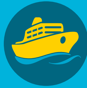
Chart a Course to Safe Boating

Dreaming about the first day you'll take your boat out this season? Keep your dream from turning into a nightmare by taking a boating safety course before you hit the water. Your passengers will thank you for helping to reduce their risk of injury and death in a boating accident.